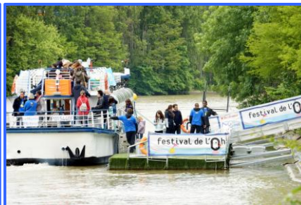
Visitors from Paris get off the boat of Festival de l'Oh!