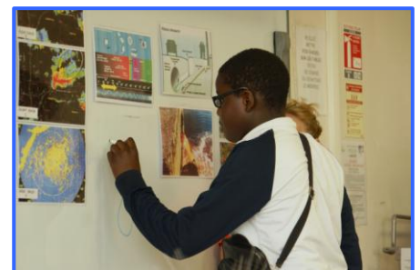
A student from Lucie Faure Secondary Schools does an exercise on urban water cycle

These workshops have been organised in the framework of "Festival Paris Montagne", an event aimed at promoting scientific knowledge among students from disadvantaged areas of Paris.