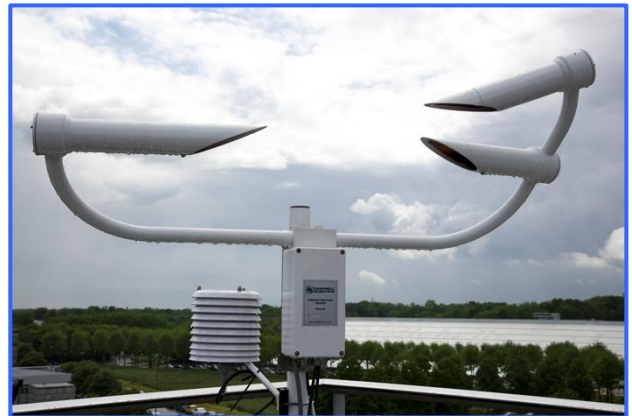
The Present Weather Sensor 100 (© Caroline Rose / École des Ponts ParisTech).

These intense rainfall events were measured by the present weather sensor PWS100, recently installed on the roof of the École des Ponts ParisTech. With a return period of 10 years, the storm that occurred from 17:20 to 17:50 is an exceptional event of great interest for the researchers of the RainGain project.